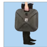
Built-in carry handle for ease of movement