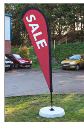
Concrete base with small teardrop Flying Banner