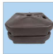
Second tank (part FBSMTK) recommended for large flags outdoors