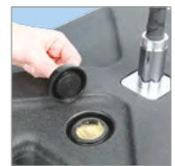
Screw cap for ease of filling