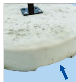
Lever points provided for ease of movement